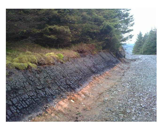
Planting on peat (above) and sediment transfer following clear felling.

a serious blow to our Climate change ideals. It happens.